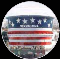
LARGE BELL HOPPER