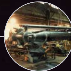
STEAM TURBINE SEPARATOR