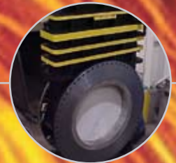
HOT BLAST VALVE