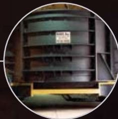
ELECTRIC ARC FURNACE