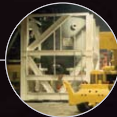
NUCLEAR STEAM GENERATOR