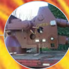
HYDRAULIC BLEEDER VALVE