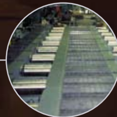
CASTER ROLLOUT TABLE