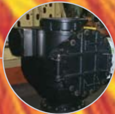
EQUALIZING & RELIEF VALVE