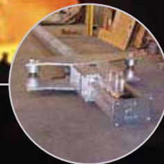
IN BURDEN PROBE