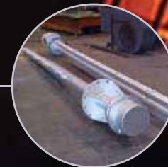
ABOVE BURDEN PROBE