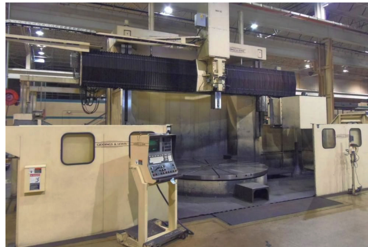
Giddings & Lewis 180 VTC CNC Vertical Boring Mill.

Applications include valves and valve assemblies, tank bottoms and tank assemblies. Foundations are complete and equipment is being installed. The boring mill will be up and turning in April.